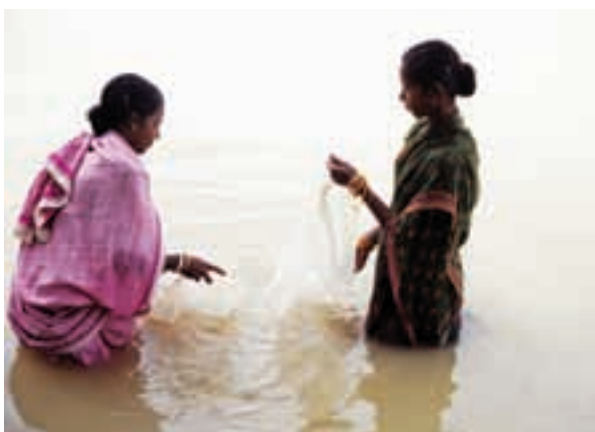
Diversification of livelihoods through pisciculture